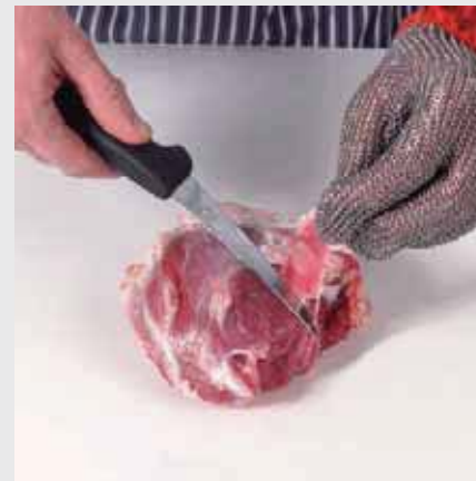
7. Remove gristle and connective tissue. Maximum fat thickness 5mm.