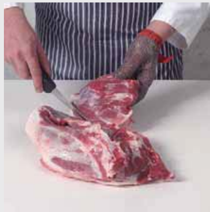
6. Continue cutting along this seam until the topside muscle is released.