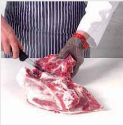
5. Start cutting along the seam between the topside and the remainder of the leg.