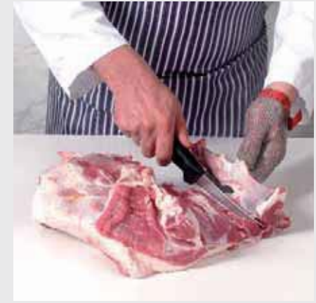
4. Carefully remove the aitch and tail bones.