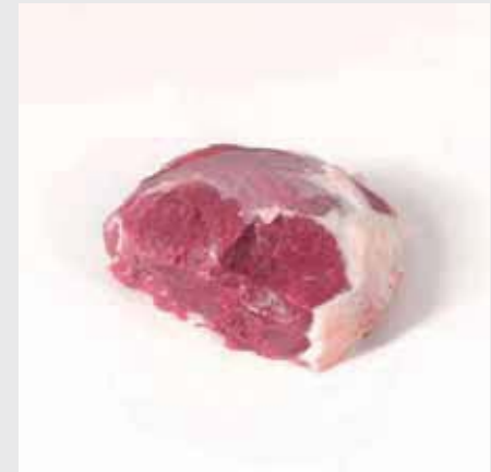
8. The trimmed and prepared topside muscle.