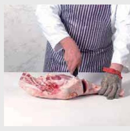
3. Remove the knuckle by cutting through the knee joint.