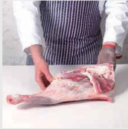
2. Leg and chump removed from the carcass.